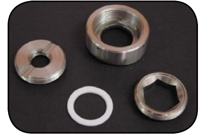
Shower Header Adaptors