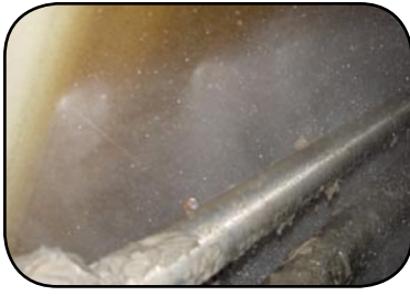
Sharp Reliable Cutting Action