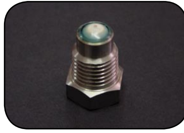
The "CERADOME" Nozzle