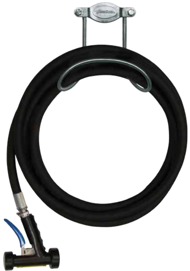
Shown: HR-100 Wall-Mounted Hose Rack; shown with premium hose assembly and S-70 Series nozzle.

Using \frac{5}{8} " Masonry Drill, drill two holes on a horizontal line made deep enough to admit the Loxin Shields. Insert Shields with nut end to back of hole and tighten screw until rack is securely fastened to wall.